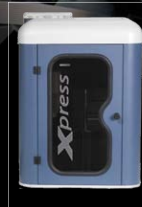
Optional Locking Security Cover